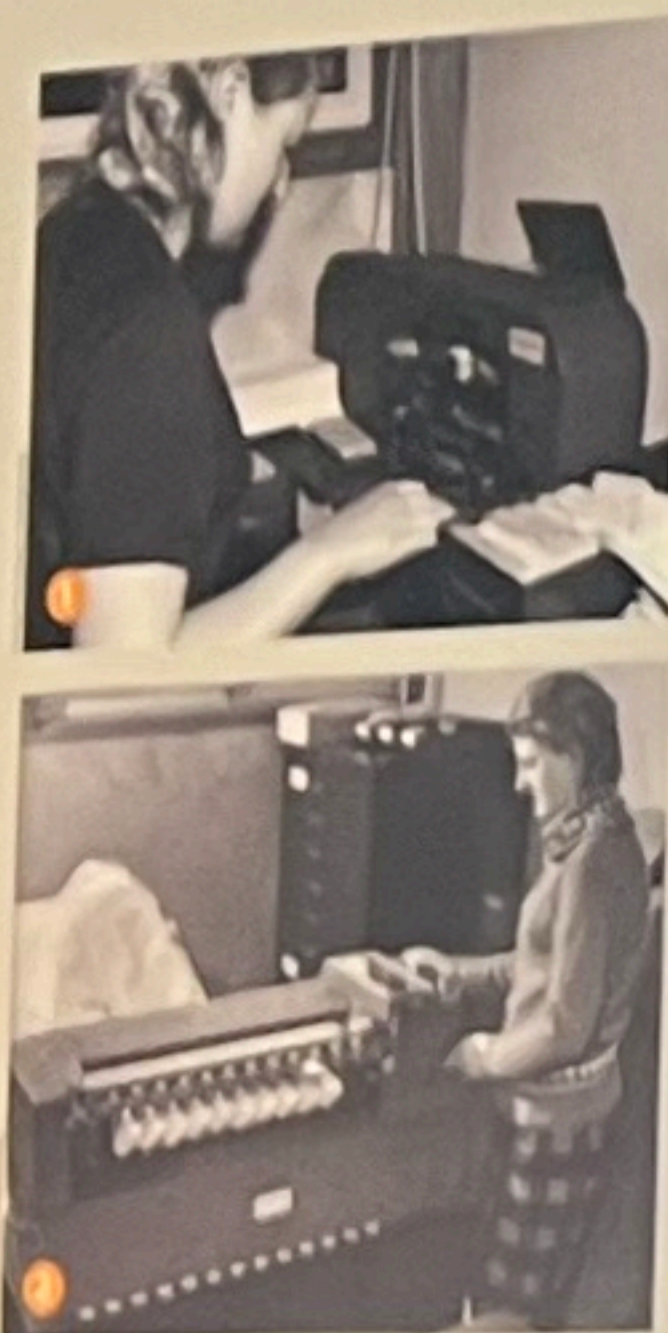
Operator at Powers-Samas punch, ca. 1942. The system used to compile data for The Atlas of the British Flora used 40-column cards that were less than half the size of a traditional IBM punched card.

The results were used in the British Flora in 1950.